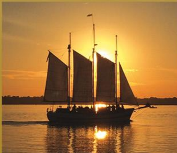
The Schooner PRIDE