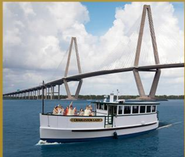
The Charleston Lady