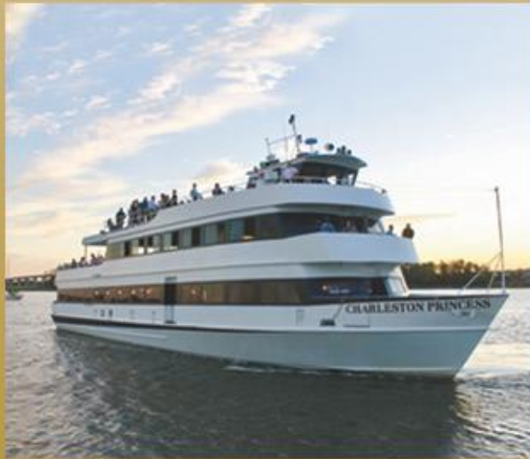
The Charleston Princess