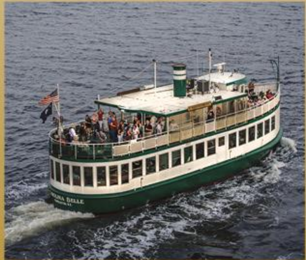
The Carolina Belle